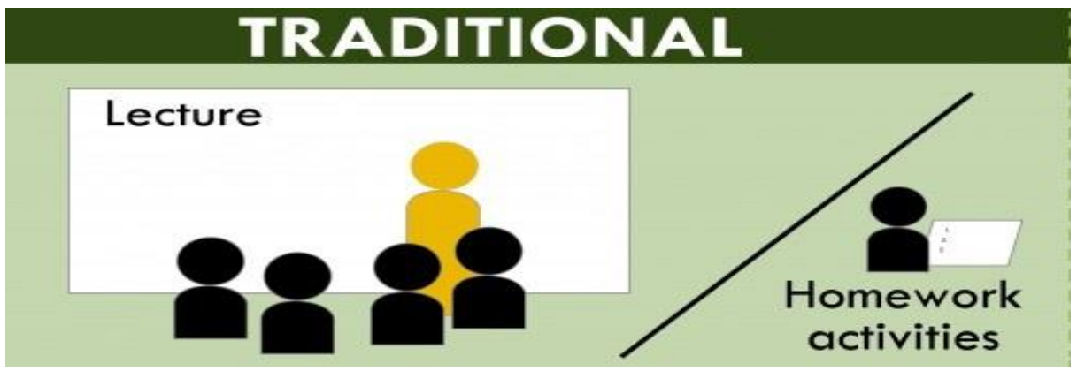
Figure.1: Pictorial Concept of Traditional Learning Method

The Project-Based teaching- learning strategy is a learner-centred instructional approach that is based on three constructivist learning principles (i) learners are engaged actively (ii) learning process is context specific (iii) Goals are achieved by sharing the knowledge between the learners (Kubiatko & Vaculová, 2011). The project-based learning is also called the inquiry-based learning where the course content is provided by questions and problems related to the real-world context (Al-Balushi & Al-Aamri, 2014) that leads to useful learning practices (Kwon et al., 2014). The project-based learning strategy has connections with other learning