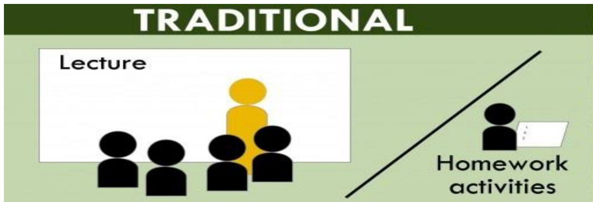
Figure.1: Pictorial Concept of Traditional Learning Method

The Project-Based teaching- learning strategy is a learner-centred instructional approach that is based on three constructivist learning principles (i) learners are engaged actively (ii) learning process is context specific (iii) Goals are achieved by sharing the knowledge between the learners (Kubiatko & Vaculová, 2011). The project-based learning is also called the inquiry-based learning where the course content is provided by questions and problems related to the real-world context (Al-Balushi & Al-Aamri, 2014) that leads to useful learning practices (Kwon et al., 2014). The project-based learning strategy has connections with other learning